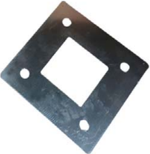
Anchor Bolt Template